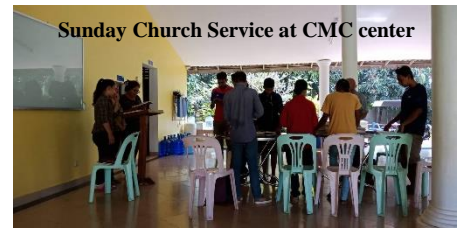
Sunday Church Service at CMC center