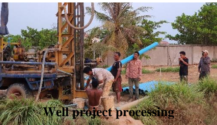
Well project processing

A) Well project Activities: Please pray for our water well projects. One well costs $2,000. Please pray and consider giving the needed funds. From beginning of April CMC is processing to check the place where the well requested from church to drill. We have ten wells in year to drill at the remote area for poor families. Please keep pray for our water well project in year that plan more to drill for poor family in community need.