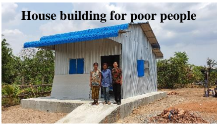
House building for poor people

concrete floor. The house size is 8 meters (26') long and 4 meters (13') wide.