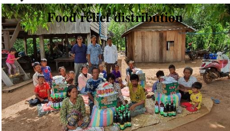
Food relief distribution

CMC distributed food relief to the six families living in Anlong Veng Oddar Meanchey and Siem Reap province. The food distribution fund from Los Gatos church, CA in the United State. Three Hundred USD ($300) to help the poor people who is facing to family income from starvation during the pandemic disease of COVID-19. Each of family they received