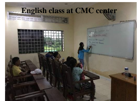
English class at CMC center

III Church Building Ministry: From CMC Cambodia is raising funds for Church building projects and housing for poor rural families. A complete church building costs $25,000 and a house $3,000. Please contact CMC for more detailed information.