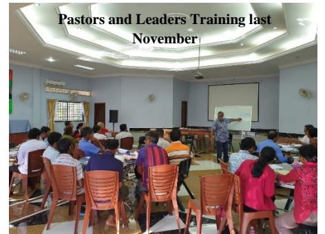
Pastors and Leaders Training last November

A) Pastors and leaders training: Please pray for our next training of Pastors and