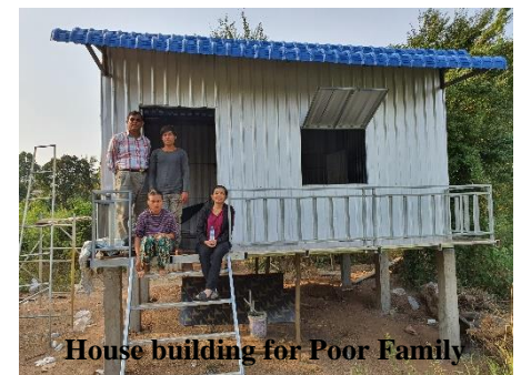
House building for Poor Family

From August 2019 to February 2020, CMC has built four houses for poor