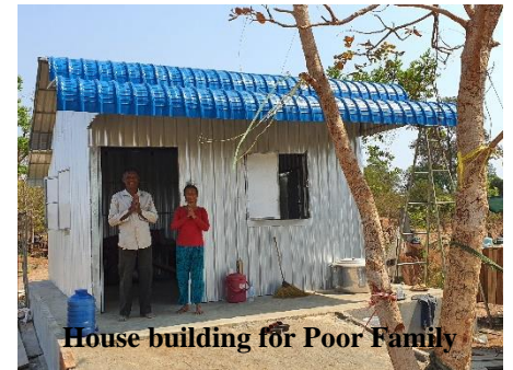
House building for Poor Family

III Church Building Ministry: From CMC Cambodia is raising funds for Church building projects and housing for poor rural families. A complete church building costs $25,000 and a house $3,000. Please contact CMC for more