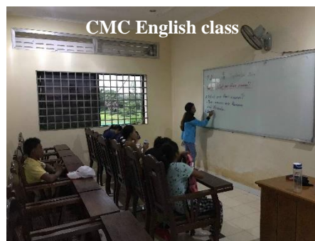
CMC English class