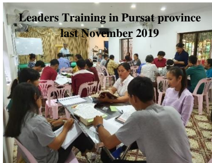
Leaders Training in Pursat province last November 2019

A) Pastors and leaders training: Please pray for our next training of Pastors and