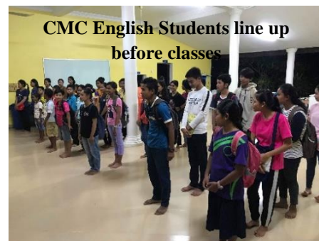
CMC English Students line up before classes

B) English Class: At the CMC center we have paid teachers. The cost is $200 monthly. At the CMC center we have 92