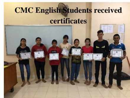
CMC English Students received certificates