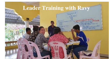
Leader Training with Ravy

A) Pastor and leader training: Please pray for God to re-open the training. Our next training of pastors and leaders is planned for November 2021. Pray also for the expenses for each course. The expenses include.