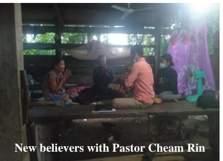
របាយការណ៍ ប្រចាំត្រីមាស អង្គការ កិច្ចការខ្មែរបំរើព្រះគ្រីស្ទ

of their hometown to share the love of God. 19 people usually attend and listen to the good news of God. They preach the good news of salvation in Jesus to