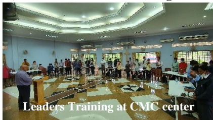
Leaders Training at CMC center