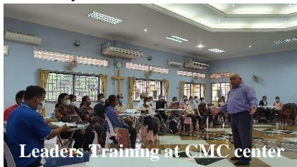
Leaders Training at CMC center