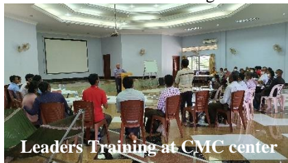
Leaders Training at CMC center

Please pray and contribute to equip our pastors and leaders in Cambodia so they will be able to win souls for Christ. Students in three provinces will attend the CMC training in June.