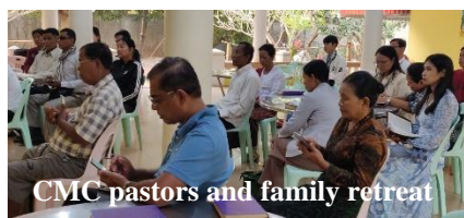
CMC pastors and family retreat

A) Pastor and leader training: Glory be to our God, from March 08 th -11 th , Cambodian Ministries for Christ is very grateful to God for an opportunity to organized for the first time a Pastors and family Retreat at CMC Siem Reap center in the total of 49 Pastors and their Families in attendance. Thanks be to God for His reminding us to "stay humble and live simple" in serving Him. May God keeps His servants to staying faithful until last breath. We at CMC are very grateful to our Lord Jesus Christ for his mercy and favor in using us and blessing our ministry. We also would like to say thank you very much to donors and Churches who have supported the needs of the retreat.