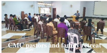
CMC pastors and family retreat

Please pray for the next training for pastors, pray and contribute to equip our pastors and leaders in Cambodia so they will be able to win souls for Christ. Students in three provinces will attend the CMC training from June 6 th -22 nd .