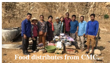
Food distributes from CMC

A) Food relief Activities: Cambodian Ministries for Christ distributed food relief and material to a family of church member living in Takream village, Bannan district, Battambang provinces,