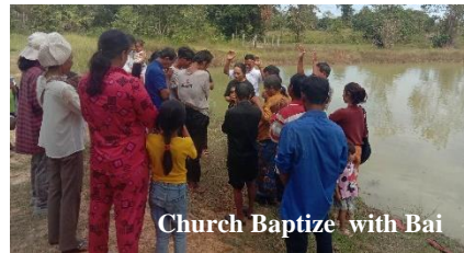
Church Baptize with Bai

preaches the good news of salvation in Jesus to everyone, with around Seventy-Five people in attendance. This quarter Seven people have believed in Jesus as their Savior and Seven of them were baptized. Please pray for new people who have trusted