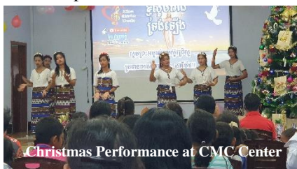
Christmas Performance at CMC Center

Glory be to our God; this December Cambodian Ministries for Christ had a celebration of Christmas with many of our congregations coming from different churches. We rejoiced in the fellowship of believers and unbelievers