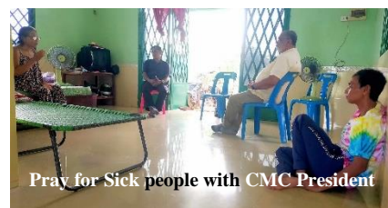
Pray for Sick people with CMC President