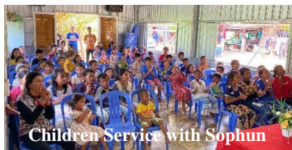
Children Service with Sophun