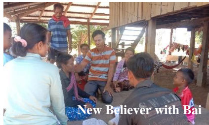
New Believer with Bai

preaches the good news of salvation in Jesus to everyone, with around Seventy-Five people in attendance. This quarter Seven people have believed in Jesus as their Savior and Seven of them were baptized. Please pray for new people who have trusted