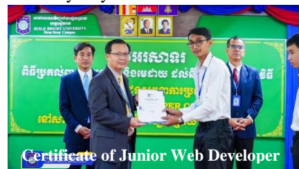
Certificate of Junior Web Developer