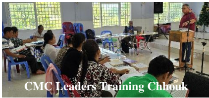
CMC Leaders Training Chhok

the Pastors and Leaders training. Please pray for the coming training for pastors and leaders will continue in May, pray and contribute to equip our pastors and leaders in Cambodia so they will be able to win souls for Christ. We are thankful for the Lord reminding us to “Stay humble and live simple” serving. May God keep His servants staying